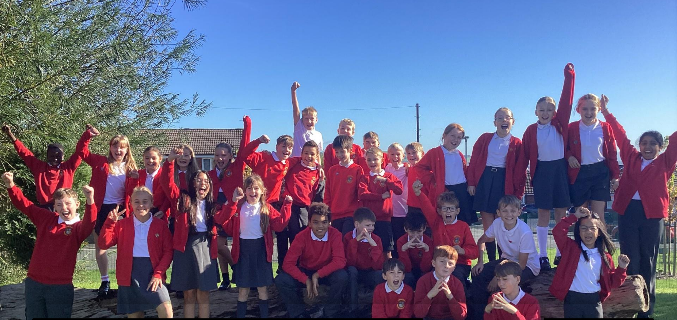
Year 6 Curriculum Meeting